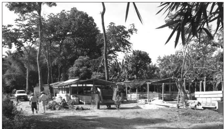
Figure 3 HELPS Rio Brovo stove factory