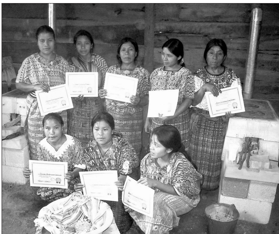
Figure 4 Trained stove promoters with their certificates

This is the scaling up phase. The tools produced for the limited quantity of a pilot project must be re-thought for higher production quantities since different types of manufacturing technique may be more economical. For example, sheet metal parts that have been previously cut by hand might be produced more economically in a stamping press even when the cost of a stamping die is included. It cannot be over emphasized that all parts of the project must be scaled-up at the same time. It does not do any good to scale-up production if distribution or