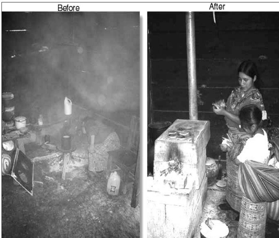
Figure 2 Impact of stove installation on kitchen

stoves are sold to other NGOs for use in their community development projects. Some of these NGOs elect to part-subsidize their installations; others use micro-credit, while others sell at full price up front. All NGOs and end users receive in-depth training and follow-up inspection.